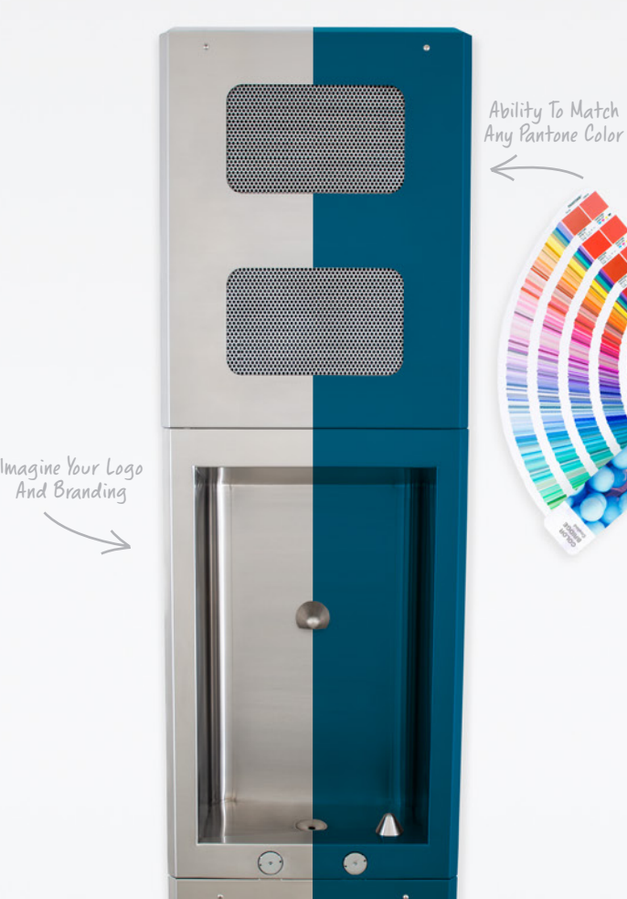
All Custom Designs. You can even choose to cut out sections to show the stainless steel.